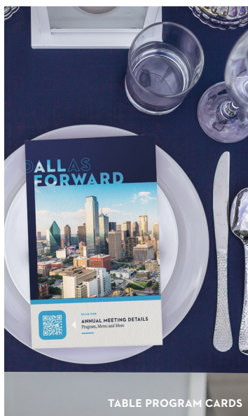
TABLE PROGRAM CARDS