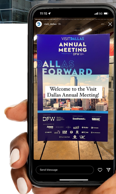
VISIT DALLAS SOCIAL POST

The Visit Dallas Annual Meeting is the region's leading gathering of Dallas tourism and hospitality leaders, business owners and elected officials. With more than 750 attendees expected, this is an ideal platform to engage a captive, engaged audience with your brand initiatives. At the meeting, we will look back at the impact our hospitality community has had over the past year and hear about exciting plans for a bright future.