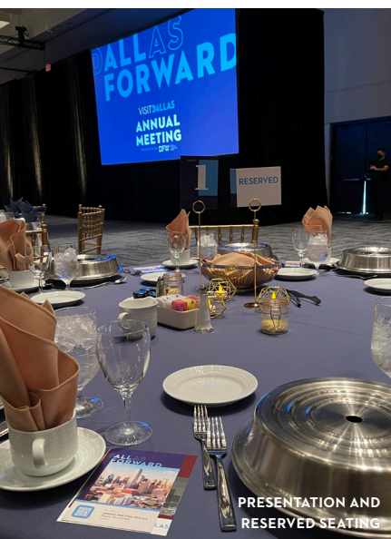
PRESENTATION AND RESERVED SEATING