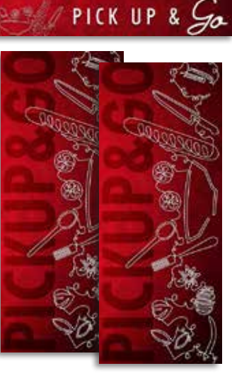
CSFLEXMERCH2 — Pickup & Go (Full Kit) CSFLEXMERCH4 — Pickup & Go (Top Panel Only Kit)

CSFLEXMERCH — Fresh & Fast (Full Kit) CSFLEXMERCH3 — Fresh & Fast (Top Panel Only Kit)