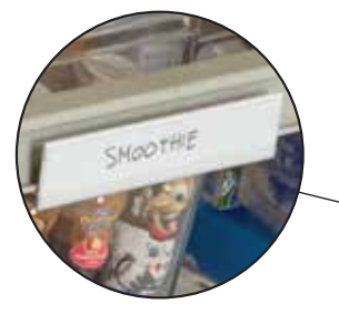
12 ID tags included with each unit