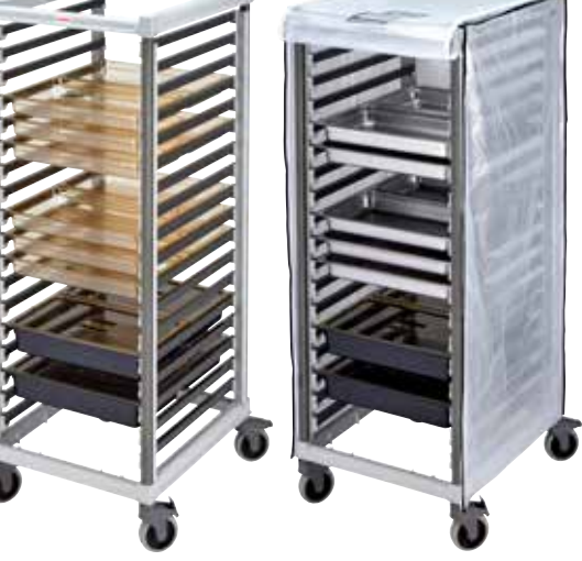
GBCTUGNPR21 Optional Heavy Duty Vinyl Cover for GN 2/1 Full Size Trolley.