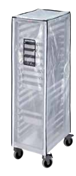
GBCTUGNPR11 Optional Heavy Duty Vinyl Cover for GN 1/1 Full Size Trolley.

All Trolleys ship knockdown (KD) complete in 1 box with casters and bottom frame wedges factory assembled on posts.