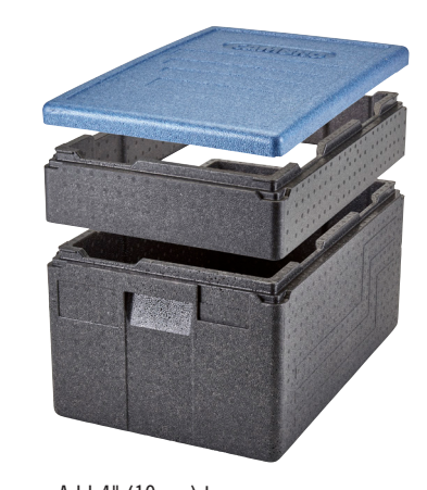
Add 4" (10 cm) to your top loader GoBox to fit oversize items.