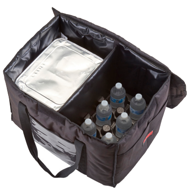
Comes with structured bottom and divider panel.