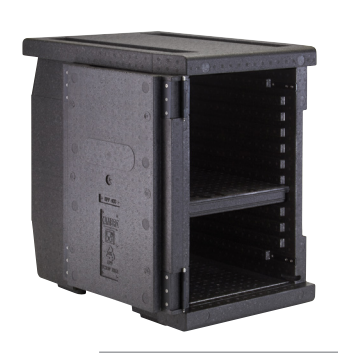
FULL 270° ACCESS Durable hinges allow the door to open 270° and remain open securely to the side of the front loader for easy access to products.