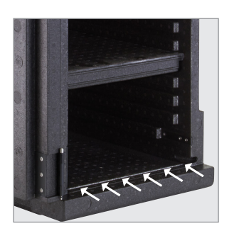
DRIP-RESISTANT Built-in condensation barrier helps front loaders to remain drip-resistant.