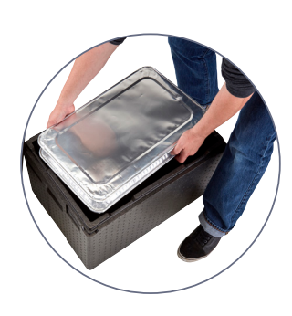
With extra width for easier loading of food pans.