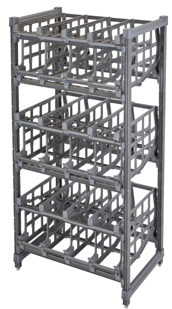
ESU243672C96 Elements Unit (Empty)