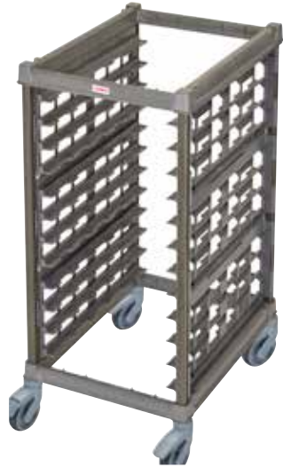
Metal Caster UPR1826H12