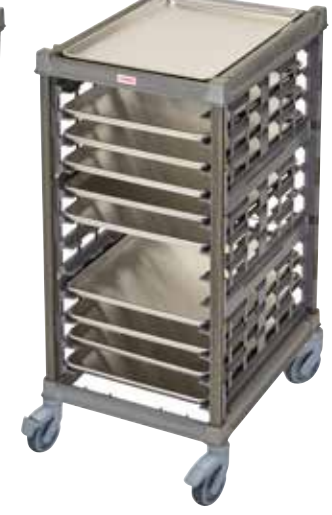
Plastic Caster UPR1826HP12 $ 560.00