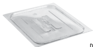
Cover with Handle Deep molded handle for easy lifting.