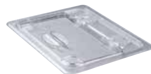
FlipLid® Keeps content covered yet flips up easily for service.