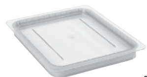
GripLid® Lid "grips" the side of the food pan for superior spill control.

Camwear polycarbonate food pan covers improve food safety, and save on time and labor.