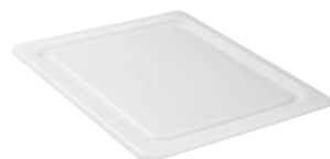
Seal Cover Economical cover.