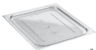
Flat Cover Basic cover for all sizes of food pans.

Cambro offers the widest range of food pan covers for improved food safety and product freshness.