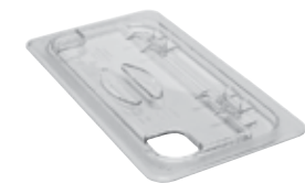
Notched FlipLid® Spoon rests in contents with lid closed.