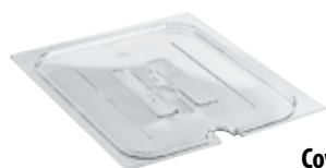
Notched Cover with Handle Allows utensils to remain in pan and off of potentially contaminated counters.