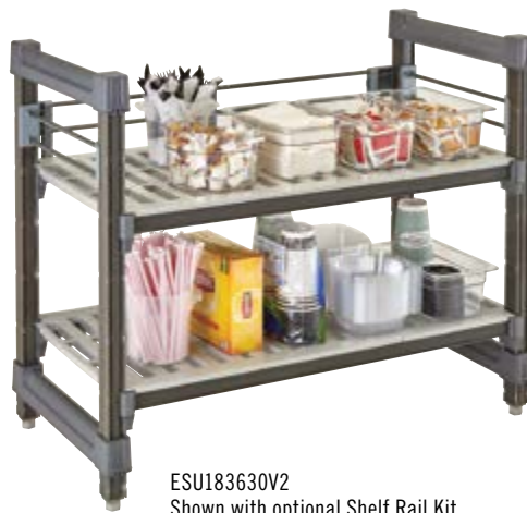
ESU183630V2 Shown with optional Shelf Rail Kit.