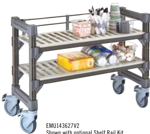
EMU143627V2 Shown with optional Shelf Rail Kit.