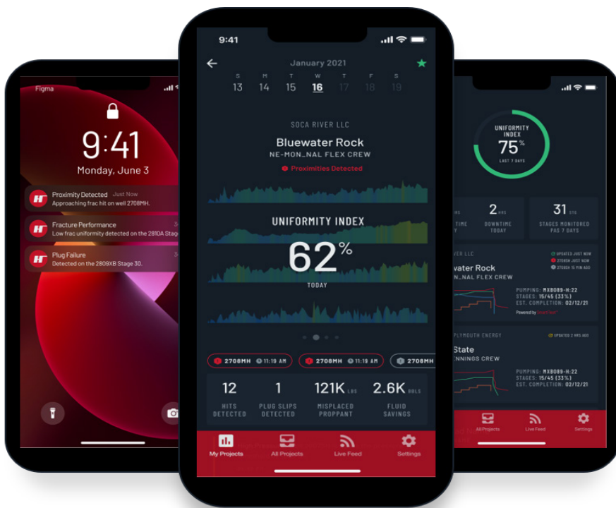
The SmartFleet app makes real-time insights more accessible, giving you access to fracture performance anytime, anywhere.

To learn more about the SmartFleet system contact your local stimulation expert. or visit us on the web at www.halliburton.com