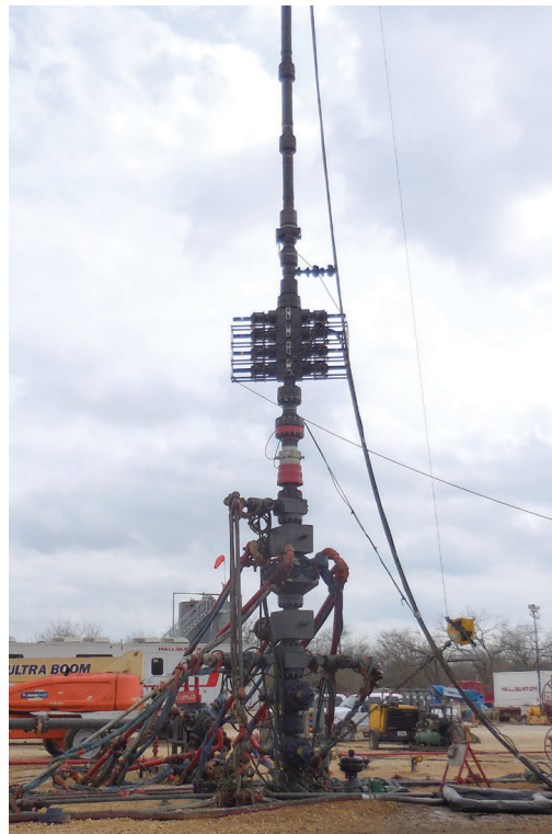
The ExpressKinect ™ Quick Latch replaces the threaded connection with a remote-operated hydraulic connection for a much safer operation.