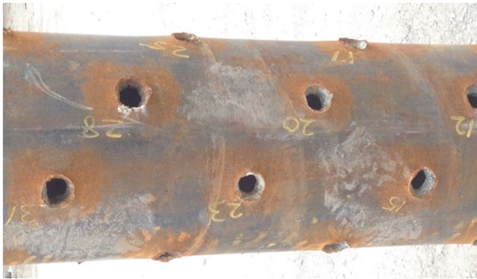
Casing used for test

A validation test was performed with the 9 5/8-in. Drill Tech deburr mill and a piece of perforated 9 5/8-in. 47 ppf casing. The casing was held in place and the Drill Tech deburr mill rotated and reciprocated using a torque machine.