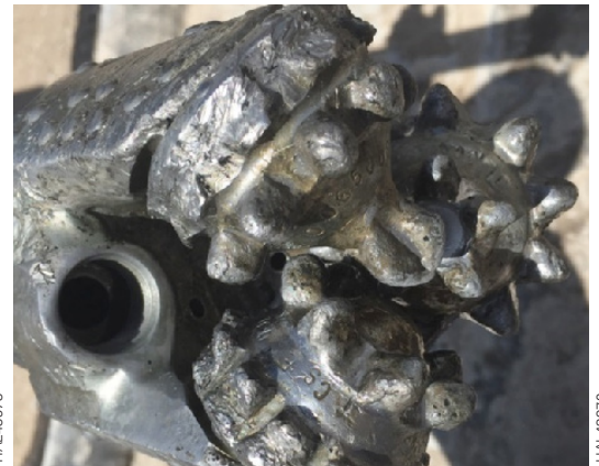
Roller cone Bit #1 - Drilled out 70 Obsidian® frac plugs with no short-trip