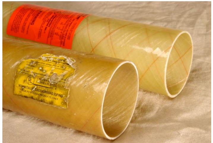
Old vs. New - Pipe in the foreground was installed in 1973 and removed 27 years later when the station closed.

Where secondary containment is needed, Red Thread IIA provides a true pipe-in-a-pipe system. Containment pipe is identical to the primary pipe. Sections are joined together with matching two-piece clamshells that are bonded and bolted together. One half of the clamshell fitting is pre-fitted with female threaded fasteners to make assembly fast and easy from one side of the fitting.