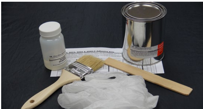
Adhesive Series 8000

Fiber Glass Systems offers two adhesive lines: Series 8000 and PSX. Both lines can be used on Red Thread IIA and Dualoy pipe. Series 8000 is typically used for bonding primary pipe and fittings. A thickening agent is offered for bonding secondary containment fittings, particularly in warmer weather. PSX-20 is typically used for bonding primary pipe and fittings, and PSX-34, with a higher viscosity, is typically used for bonding secondary containment fittings.