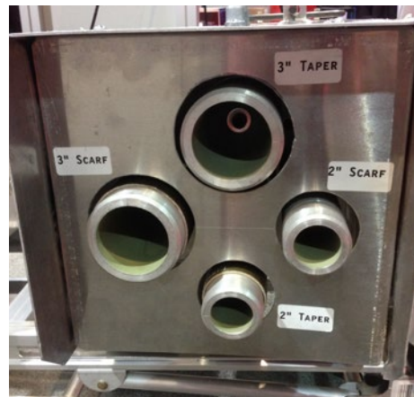
Model 3000 Tool - Tapers and scarfs 2" and 3" Dualoy 3000/LCX pipe.