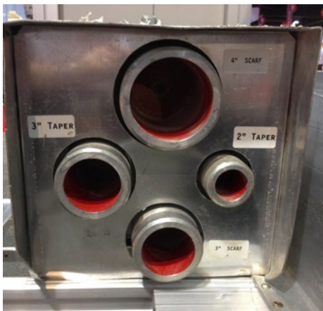
Model 2100 Tool - Tapers 2"-3" Red Thread IIA pipe, scarfs 3"-4" pipe. Taper mandrels are available for Dualoy 3000/L products.