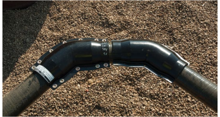
Dualoy Secondary Containment

Where secondary containment is needed, Dualoy 3000/L is very much the same as Red Thread IIA.