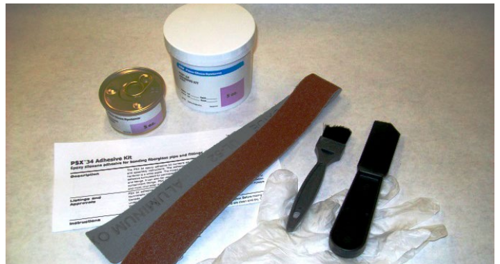
Adhesive Series PSX