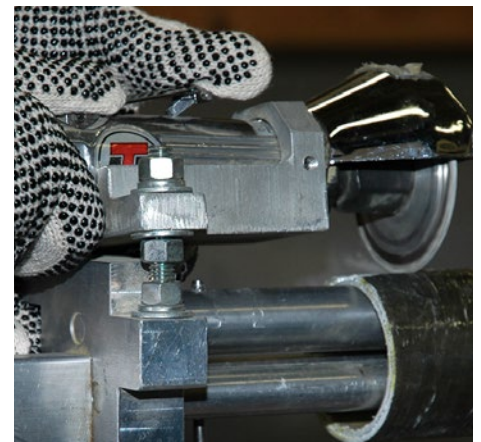
Jacket Cutter Tool - Cuts containment jacket from 2"-4" Dualoy 3000/LCX pipe