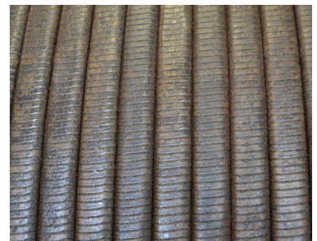
Top » Cable coating process