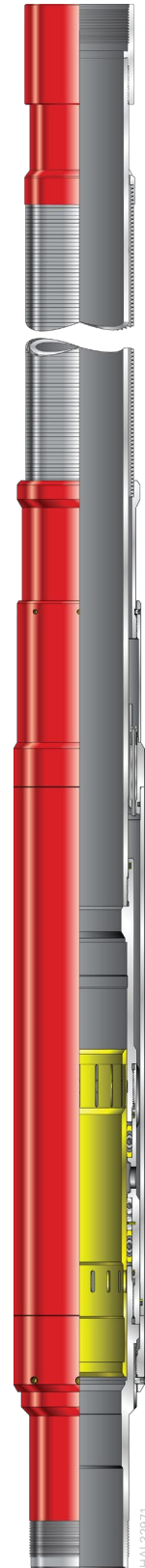
EquiFlow® Sliding Side-Door Inflow Control Device