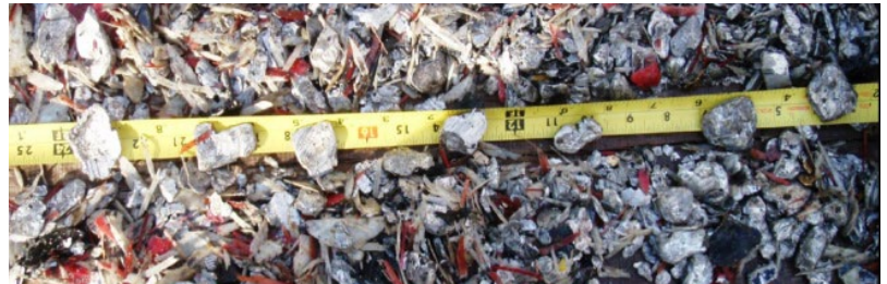
Vali Tech® filter screen recovery of 30.4 lbs aluminum cement, composite and metal recovery during Single-Trip Drillout