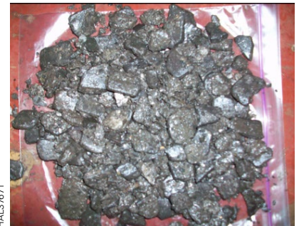
HAL 13 7671