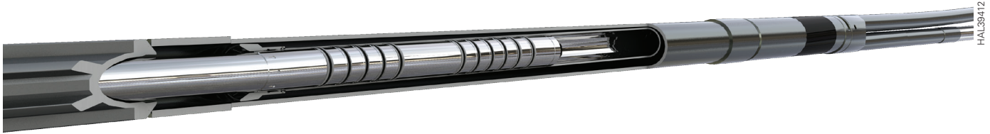
FlexRite Intelligent Completion Interface (ICI) Threaded Leg Junction