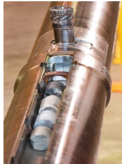
Xaminer Coring Tool