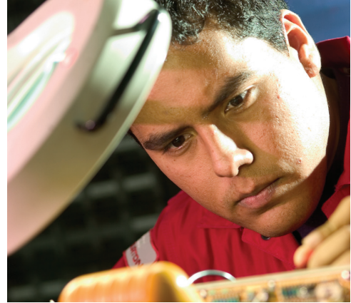
Halliburton's collaborative approach with Cobalt allowed faster and reliable decisions.

Altogether, the people, processes, and technologies deployed by Halliburton for Cobalt International Energy saved an estimated USD 10 million in rig days. The savings came from eliminating unnecessary runs, minimizing the time between runs, collecting effective fluid and rock samples, and fast turnaround time of processed data and integrated solutions delivered by Halliburton FRS teams.