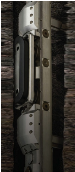
RDT tester oval pad

The data from the VSP improved reservoir knowledge and enabled optimal well placement and field planning.