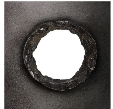
Average 1.42-inch entry hole diameter (EHD) in 9 5/8-inch 47-ppf L-80 casing