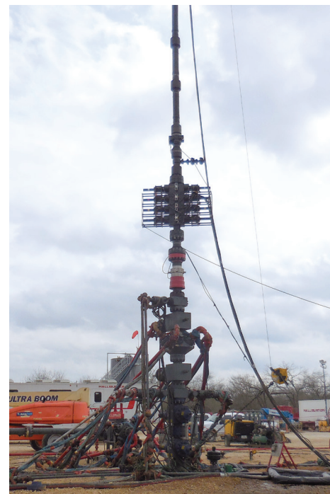
The ExpressKinect™ Quick Latch replaces the threaded connection with a remote-operated hydraulic connection for a much safer operation.

Sales of Halliburton products and services will be in accord solely with the terms and conditions contained in the contract between Halliburton and the customer that is applicable to the sale.