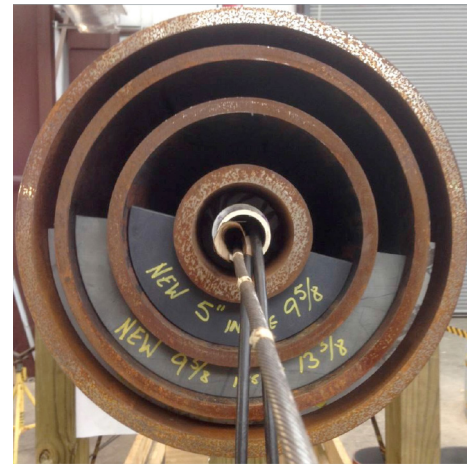
The Electromagnetic Pipe Xaminer® V tool has been thoroughly tested in multiple casing scenarios, helping to ensure that the technology is characterized and delivers an accurate metal-loss assessment. The above image corresponds to a four-casing setup, including 5-in. OD, 9 5 / 8 -in. OD, 13 3 / 8 -in. OD, and 16-in. OD casings.