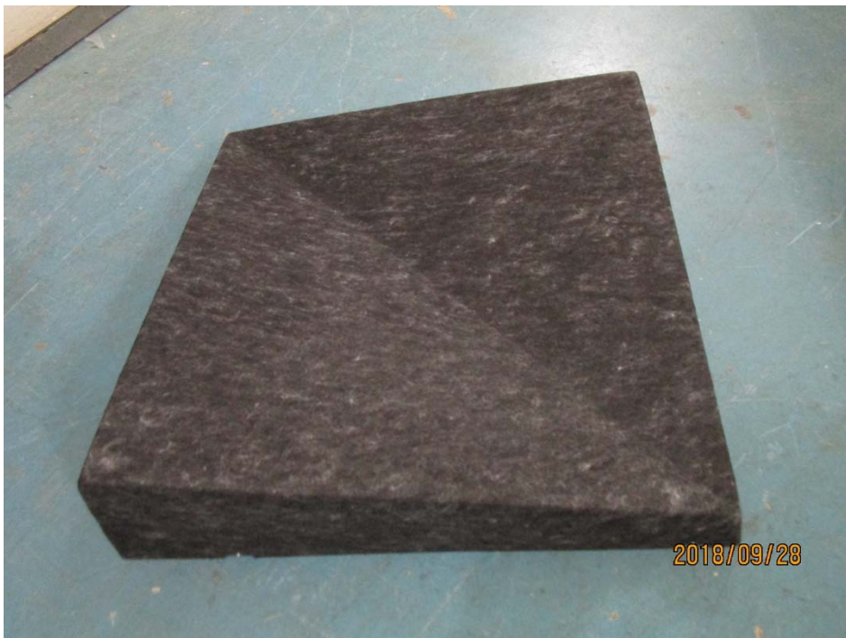
Figure 2 – Detail of individual tile