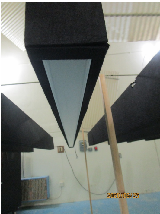
Figure 4 – Detail of materials, baffles with light fixture