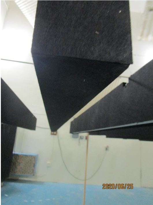
Figure 3 – Detail of materials, baffles without light fixture