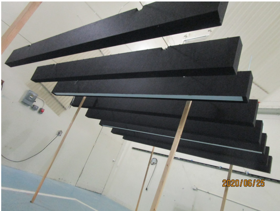
Figure 2 – Underside of specimen, position of baffles with light fixtures