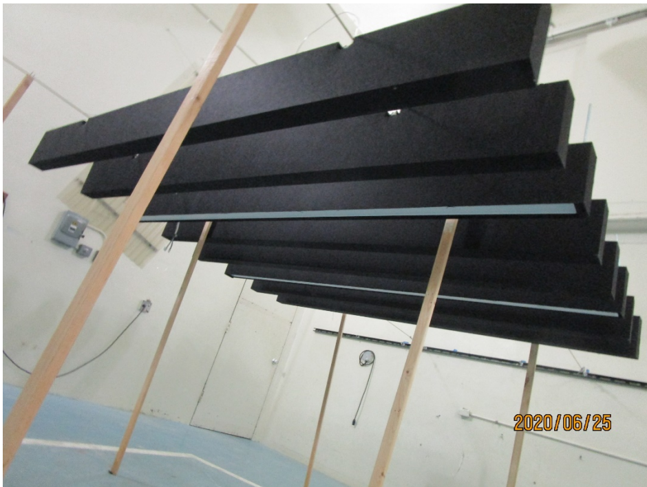
Figure 2 – Underside of specimen, position of baffles with light fixtures