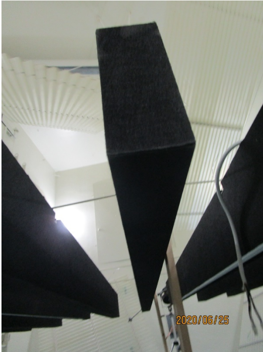
Figure 3 – Detail of materials, baffle without light fixture