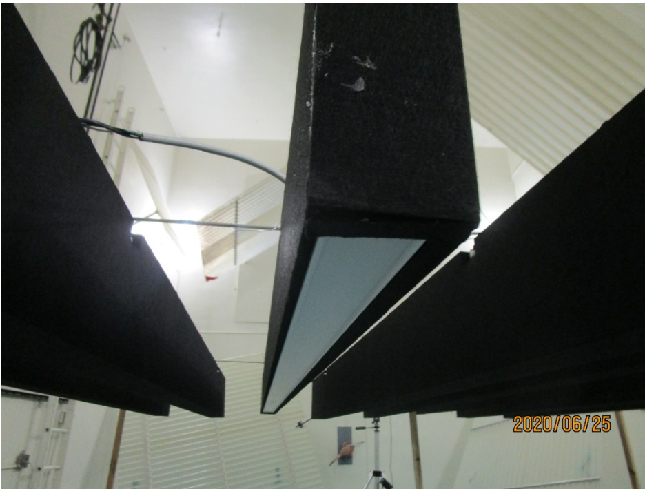
Figure 4 – Detail of materials, baffle with light fixture