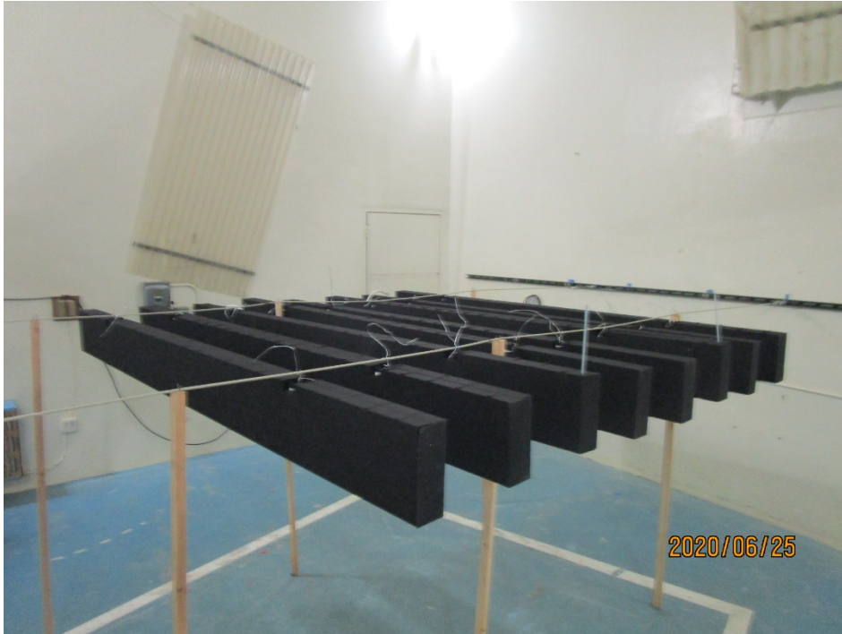
Figure 1 – Specimen mounted in test chamber