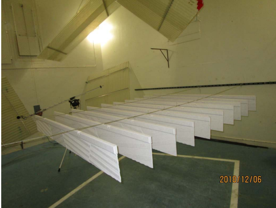
Figure 1 - Specimen mounted in test chamber