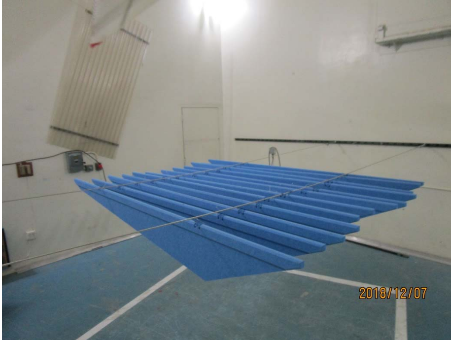
Figure 1 - Specimen mounted in test chamber, type 1 baffle mounted closest to south test chamber wall