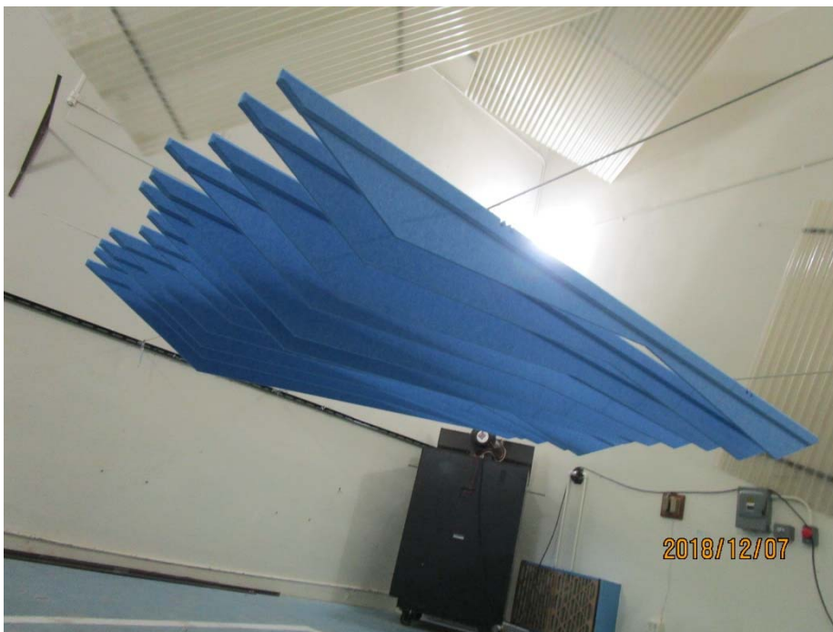
Figure 2 - Detail of varying baffle width profile