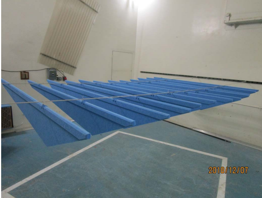
Figure 1 - Specimen mounted in test chamber, type 1 baffle mounted closest to south test chamber wall