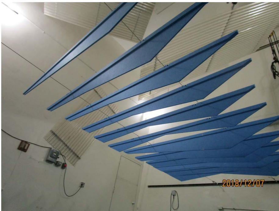
Figure 2 - Detail of varying baffle depth profile