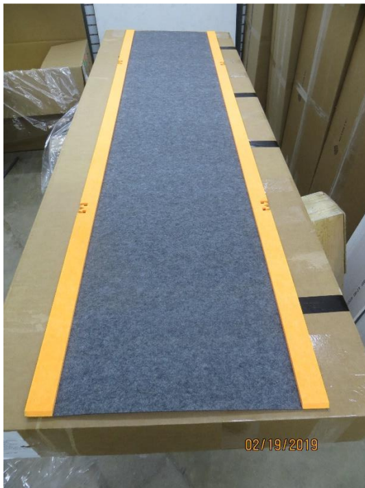
Figure 2 – Individual baffle, unfolded