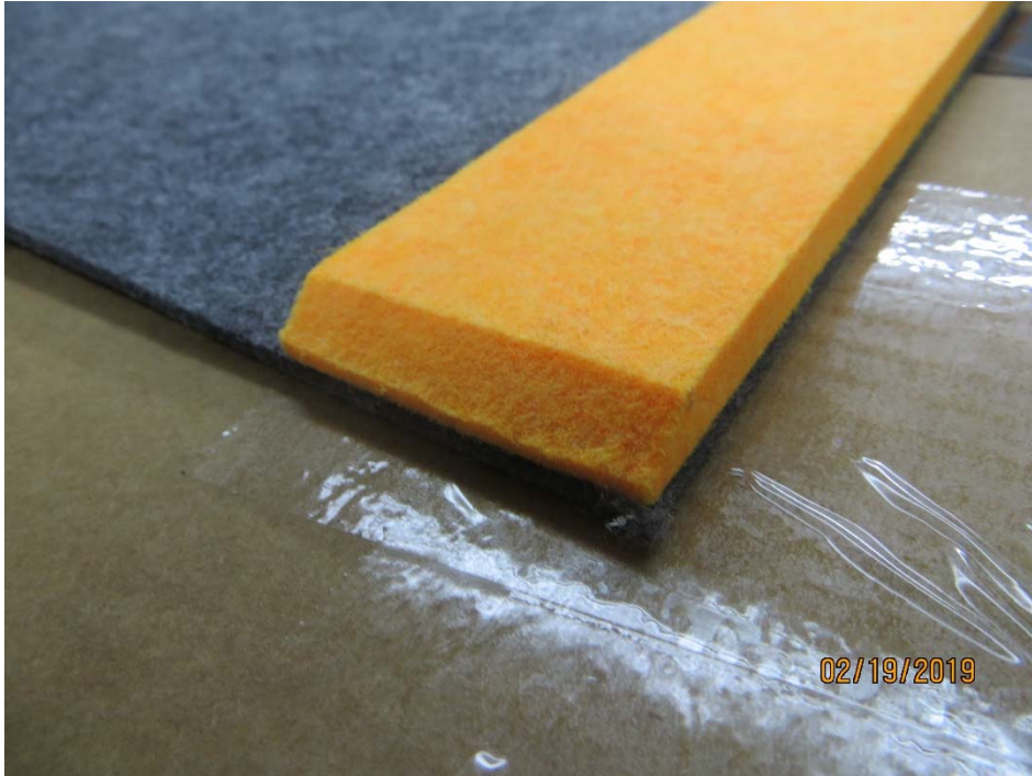
Figure 3 – Detail of specimen materials, unfolded