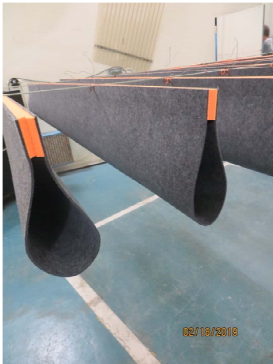
Figure 4 – Detail of installed baffles