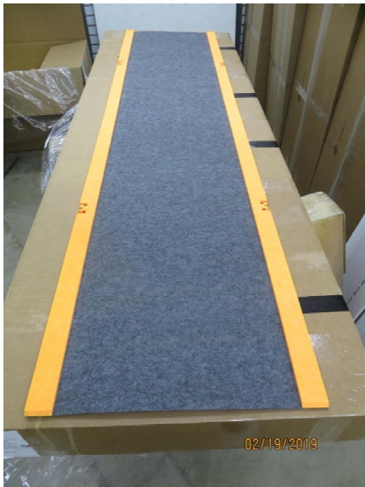
Figure 2 – Individual baffle unfolded