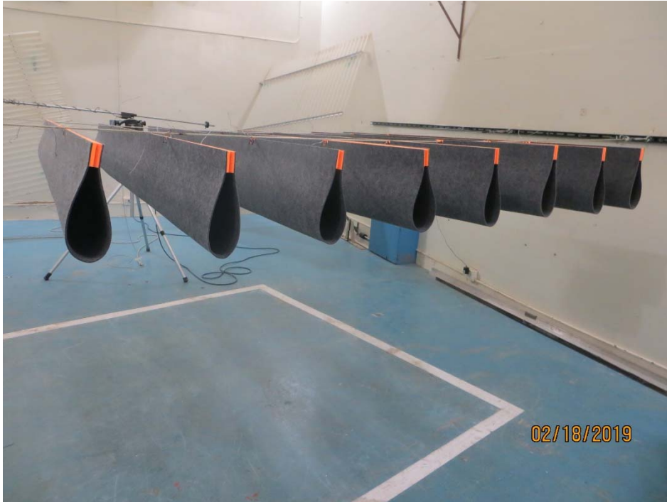
Figure 1 – Specimen mounted in test chamber