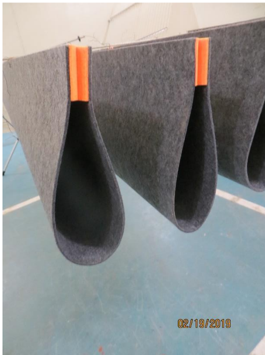
Figure 4 – Detail of installed baffles