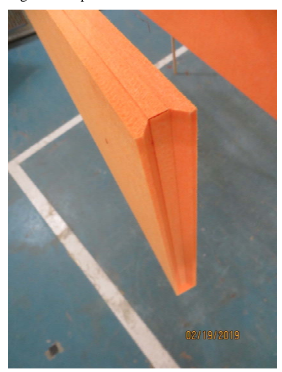
Figure 2 – Detail of specimen material