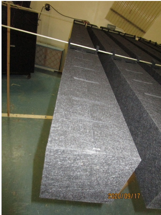
Figure 2 – Detail of specimen material