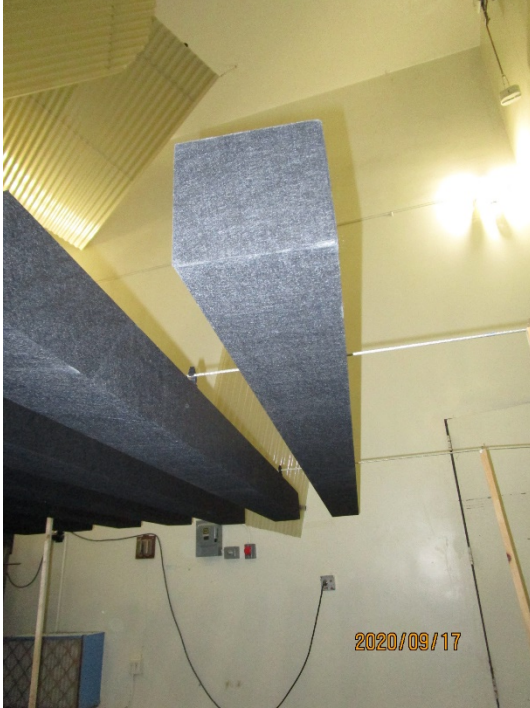
Figure 3 – Underside of individual baffle