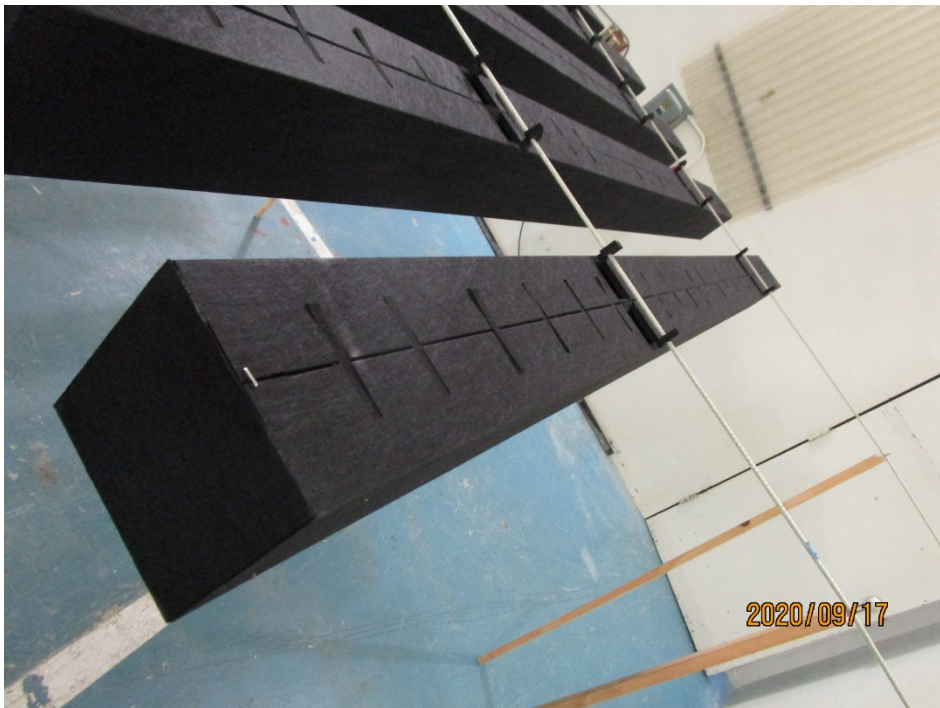
Figure 2 – Detail of specimen material