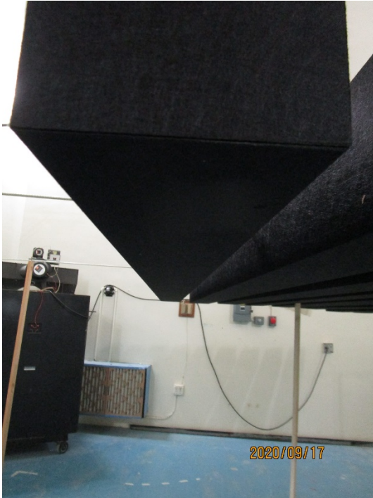
Figure 3 – Underside of individual baffle