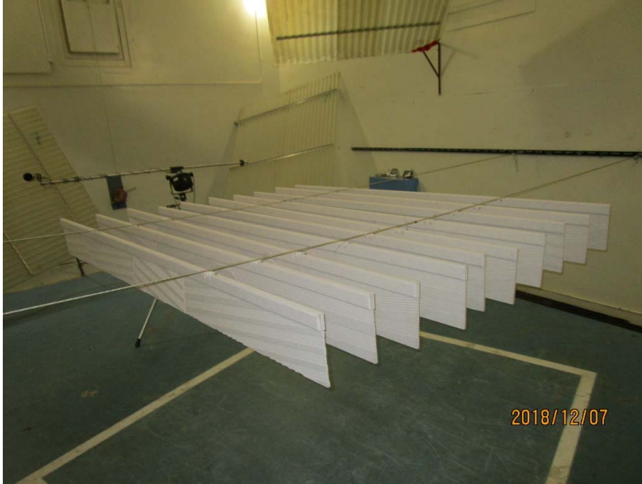
Figure 1 - Specimen mounted in test chamber