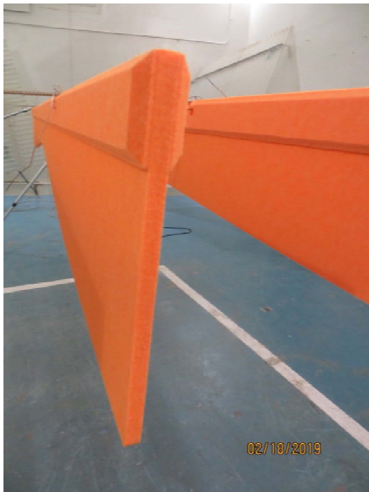
Figure 2 – Detail of specimen material