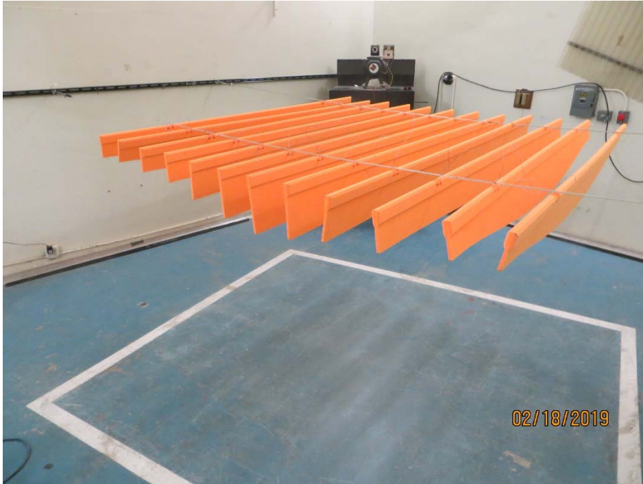
Figure 3 – Sinusoidal baffle-to-baffle endpoint depth profile