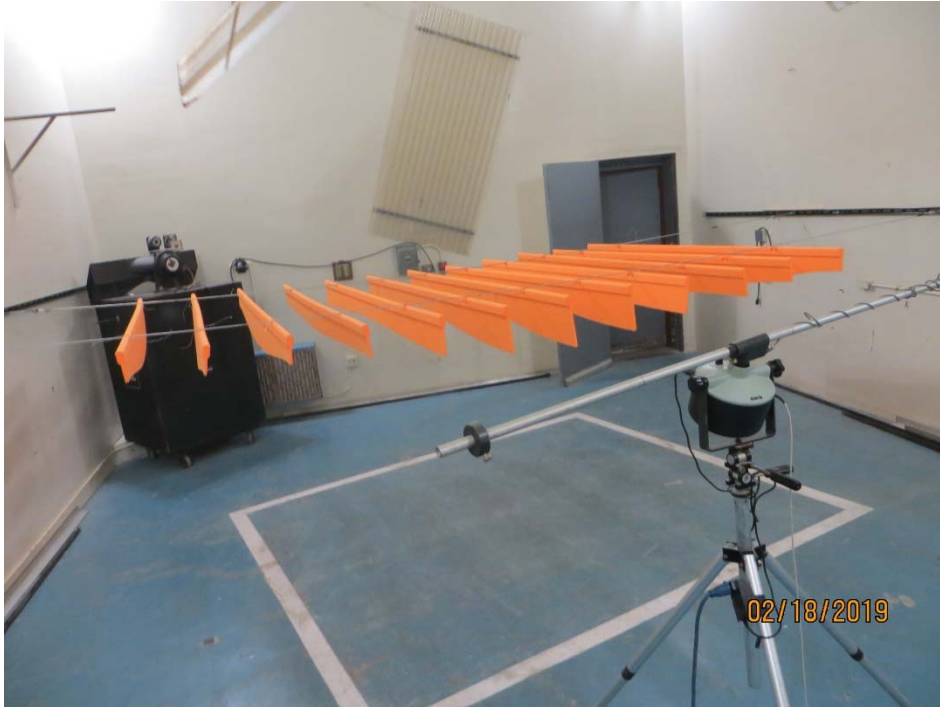
Figure 3 – Sinusoidal fin-to-fin endpoint depth profile