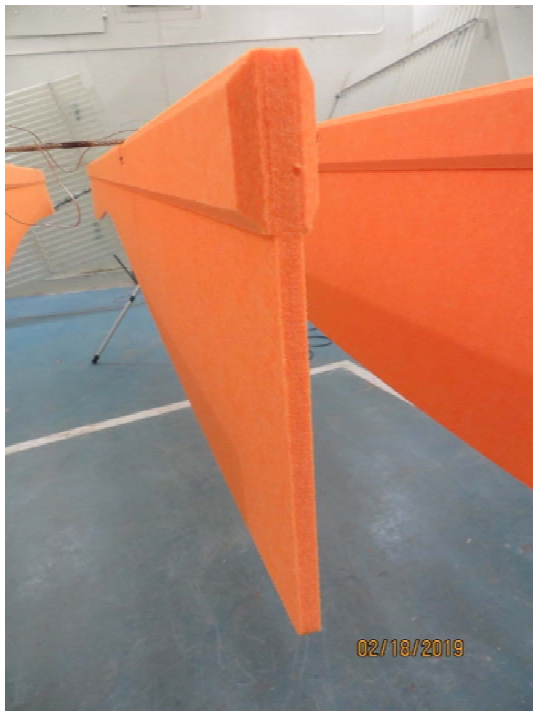
Figure 2 – Detail of specimen material