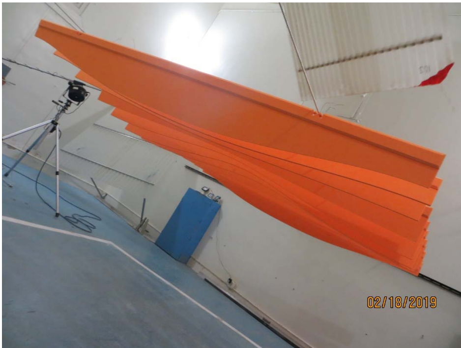
Figure 4 – Individual baffle depth profile, sinusoidal baffle-to-baffle midpoint depth profile