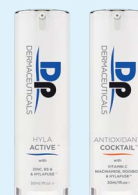
HYLA ACTIVE™ and ANTIOXIDANT COCKTAIL™