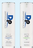
HYLA ACTIVE™ and BRITE LITE™