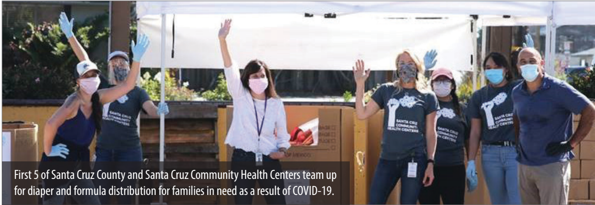
First 5 of Santa Cruz County and Santa Cruz Community Health Centers team up for diaper and formula distribution for families in need as a result of COVID-19.

The Central California Alliance for Health (the Alliance) established a new vision in 2020: Healthy people. Healthy communities. This challenging year underscored there was no better time to declare what the Alliance works to achieve for our members and communities. This report highlights the MCGP's significant impact areas in 2020.