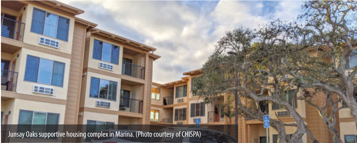
Junsay Oaks supportive housing complex in Marina.

Moon Gate Plaza (MidPen Housing) in Salinas and Junsay Oaks (CHISPA) in Marina were completed in 2020 and welcomed new residents. Both housing developments allocated 20 units each for medically complex Alliance members who receive supportive services through Monterey County Health Department's Whole Person Care Program. Residents receive on-site support from case managers with their health and personal goals, with the ultimate aim of improved health and a high quality of life. Meanwhile, construction of the County of Merced's Navigation Center is underway. The center will provide a variety of services to individuals experiencing homelessness, including low-barrier transitional housing and housing navigation services to assist participants in securing a permanent residence.