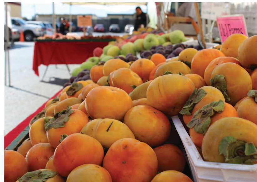
Clockwise from top left: Esperanza Farms CSA boxes; Food, What?! fresh produce delivery; Everyone's Harvest Alisal Farmers' Market; Teen Kitchen Project "Delivery Angel"