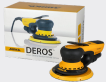
Mirka® DEROS II 150mm • 5.0mm Orbit Random Orbital Sander