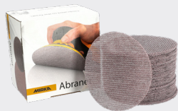
Abranet® 150mm Discs Grit 240