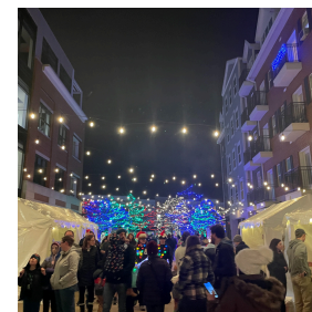
NPT NIGHT LIGHTS