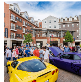
THURSDAY CAR & ART SHOW