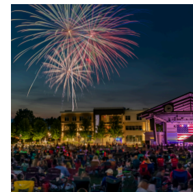
JULY 4 FIREWORKS