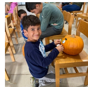
AGRI-PARK FALL FESTIVAL