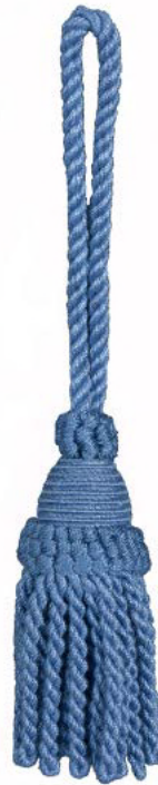
Coeur Key Tassel, Canton Blue T8012109-5 Length: 4"