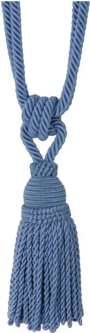
Coeur Single Tassel Tieback, Canton Blue T8012111-5 Length: 28"