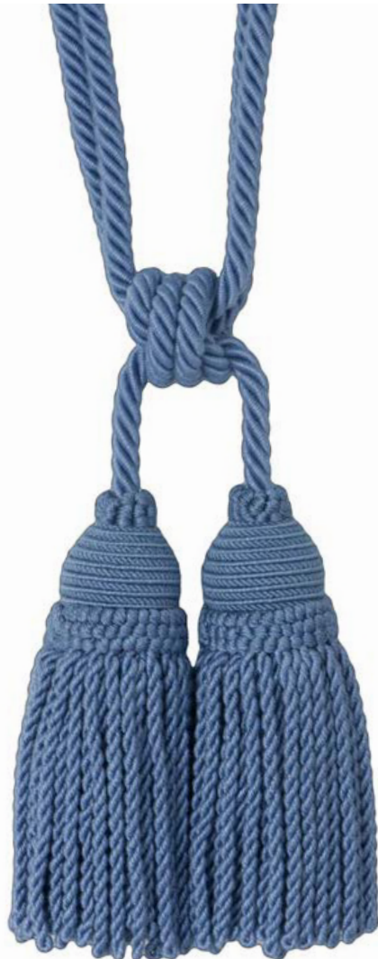
Coeur Double Tassel Tieback, Canton Blue T8012112-5 Length: 35"