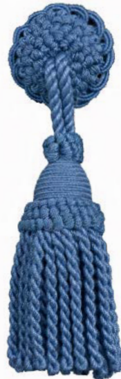
Coeur Key Tassel with Rosette, Canton Blue T8012110-5 Length: 4"