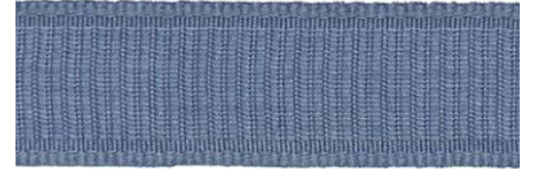
Coeur Band, Canton Blue T8012107-5 Width: 2"