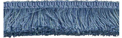
Coeur Brush, Canton Blue T8012114-5 Width: 2"