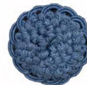
Coeur Rosette, Canton Blue T8012113-5 Width: 2"