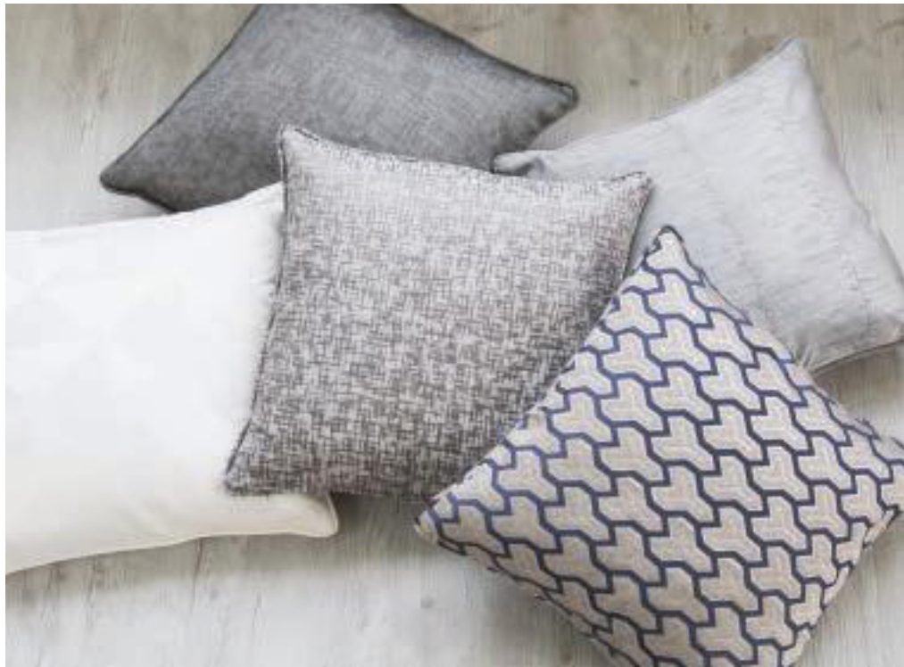
PILLOWS CLOCKWISE: SIENA IN SNOW JAG-50042-1, SALINA IN GREY FLANNEL JAG-50031-118, JUPITER IN OVERCAST JAG-50037-21, APOLLO IN OVERCAST JAG-50033-21, BETTINA IN GREY FLANNEL JAG-50034-1650.