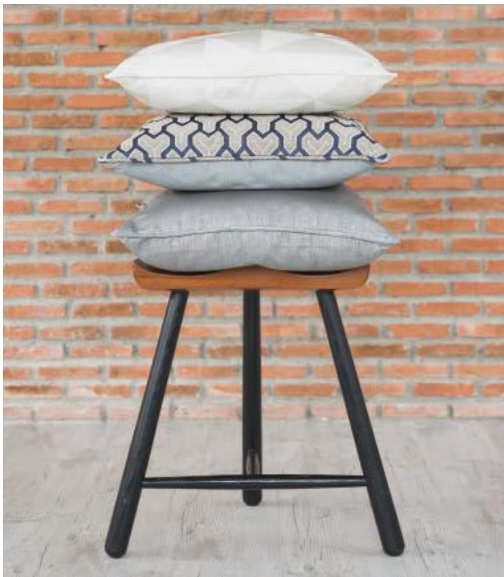
PILLOWS FROM TOP TO BOTTOM: SIENA IN SNOW JAG-50042-1, BETTINA IN GREY FLANNEL JAG-50034-1650, APOLLO IN OVERCAST JAG-50033-21.