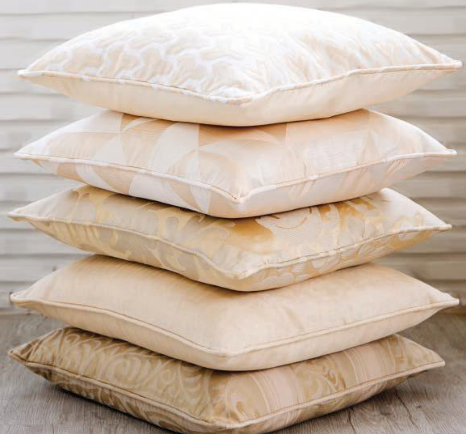
PILLOWS FROM TOP TO BOTTOM: BETTINA IN IVOIRE JAG-50034-16, SIENA IN IVOIRE JAG-50042-16, FLORAS IN LODON FOG JAG-50035-1614, SALINA IN IVOIRE JAG-50031-I, FORTUNY IN ECRU JAG-50036-1616.

As a leader in the Thai silk textile industry, Jagtar is pleased to present Phoenix, our newest collection of luxury silks. Comprised of all new distinctly modern styles including jacquard woven geometrics, graphic patterns and stylized motifs, Phoenix offers mineral earth tones that shine with opulence. Metallic shades of gold, pewter and bronze beautifully complement one another to create stunning spaces with a nod to contemporary European interiors.