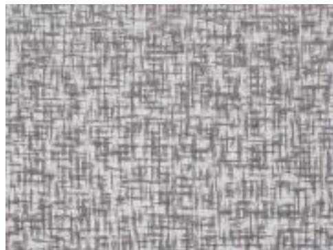
JUPITER IN OVERCAST JAG-50037-21