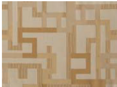
LOOP LINE IN GOLD JAG-50039-144