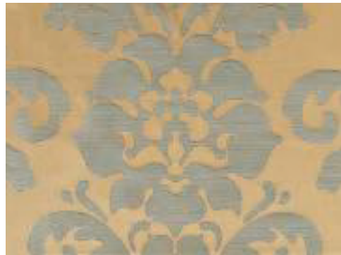
FLORAS IN WATERCRESS JAG-50035-423