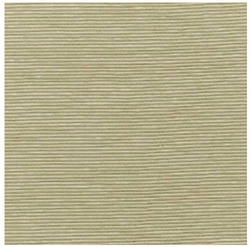
METRO IN CREME JAG-50044-16

For its latest introduction, Jagtar presents Venezia: a collection comprised of five exquisite silk weaves in a variety of brilliantly refined colors. Luxuriously plain textured silks alongside understated patterns such as a classic damask and diamond design, are offered in a variety of brilliantly refined colors, from platinum to cream and dusty blue to espresso.