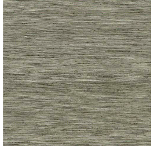
SILK TWIST IN PEWTER JAG-50052-II Also Available • Cafe Au Lait (106), Khaki (1066), Twilight Blue (113), Dorato (116), Scarlet (119), Arancia (12), Aqua Pura (13), Straw (14), Amber (1416), Platinum (16), Watermelon (19), Grey Flannel (21), Spice (24), Moss (30), Dusty Blue (5), Persian Blue (50), Espresso (6), Bronzio (616), Fraise (717)