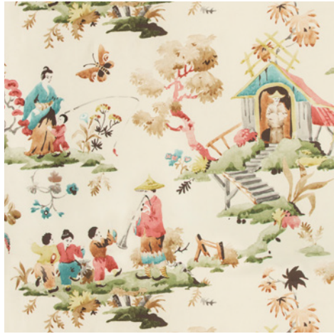
Luang Print • Meadow 8019134-337

Also available in Fern (33), Porcelain (55), Lagoon (133), Red (195), Midnight (557),