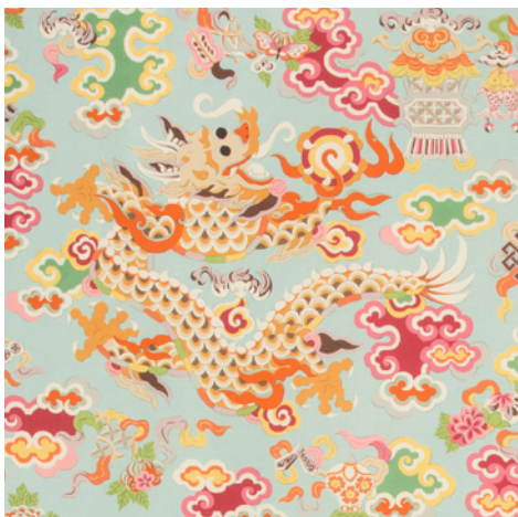
Ming Dragon Print • Aqua 8019140-137

Also available in Leaf (3), Blue (5), Petal (7), Orange (12), Delft (15), Beige (16), Ruby (19)