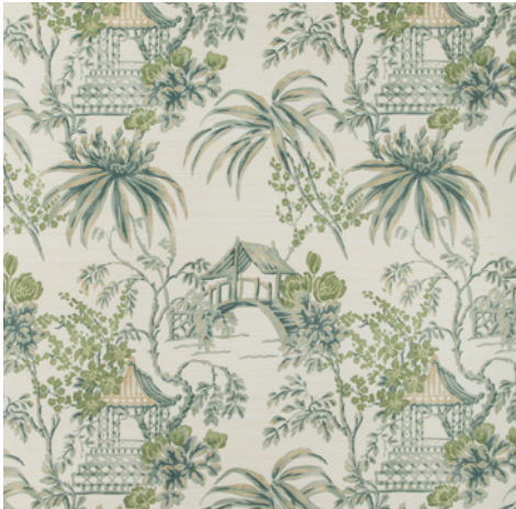
Tongli • Lagoon P8019115-133

Also available in Meadow (337), Peridot (354), Blue/Red (519), Porcelain (555)