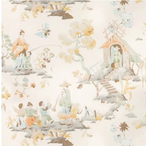
Luang • Cafe P8019116-164

Also available in Lapis (5), Indigo (50), Aqua (137), Ivory (155), Claret (195), Grey (219)