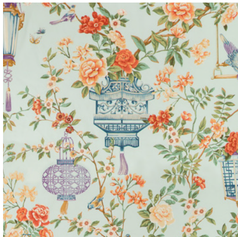
Jardin Fleuri Print • Opal 8019137-157

Also available in Dove (11), Delft (15), Beige (16), Ruby (19), Leaf (33), Porcelain (55)