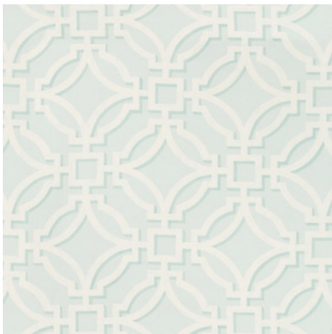
Salvy Print • Aqua 8019136-13

Also available in Navy (55), Sun (143), Pink (174), Blue (534), Red (958)