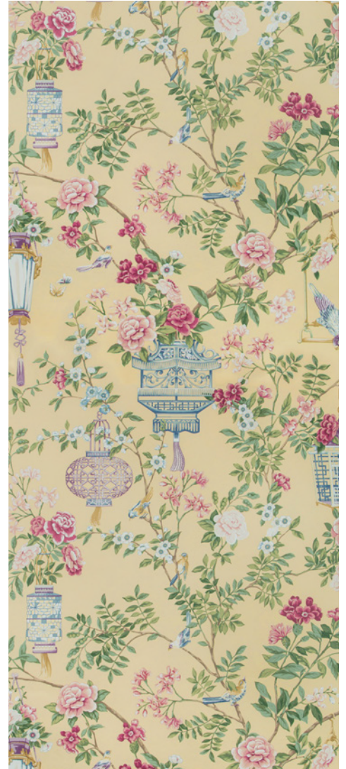
Jardin Fleuri • Opal P8019118-157

Also available in Navy (55), Pink (174), Blue (534), Red (958)