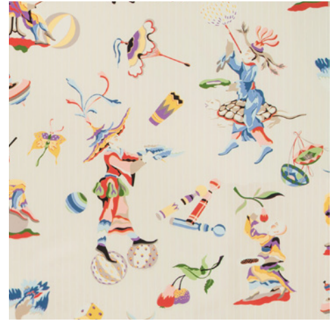
Cirque Chinois Print • Red 8019141-958

Also available in Cafe (164), Peridot (354), Blue/Red (519), Porcelain (555)