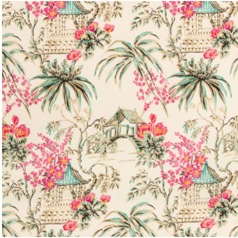
Tongli Print • Peony 8019138-713

Also available in Fern (33), Porcelain (55), Lagoon (133), Red (195), Midnight (557),