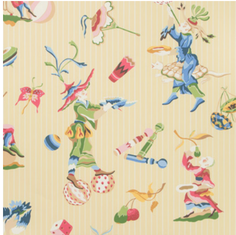
Cirque Chinois • Sun P8019114-143

Also available in Fern (33), Porcelain (55), Red (195), Midnight (557), Peony (713)