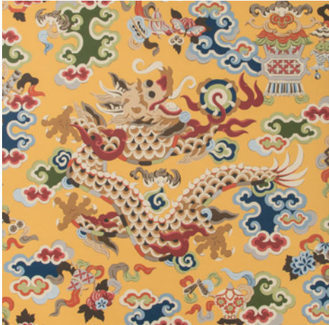
Ming Dragon • Saffron P8019113-495

Also available in Lapis (5), Indigo (50), Aqua (137), Ivory (155), Claret (195), Grey (219)