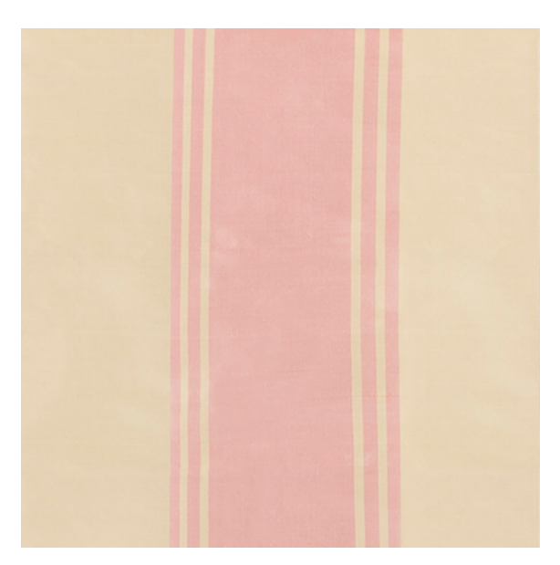
VILLA STRIPE IN DU BARRY PINK JAG-50050-7

ALSO AVAILABLE • MUDGREY (1616), GABARDINE (23), SHADOW (2430), TOMATO (24), PLUM (909), TEAL (35)