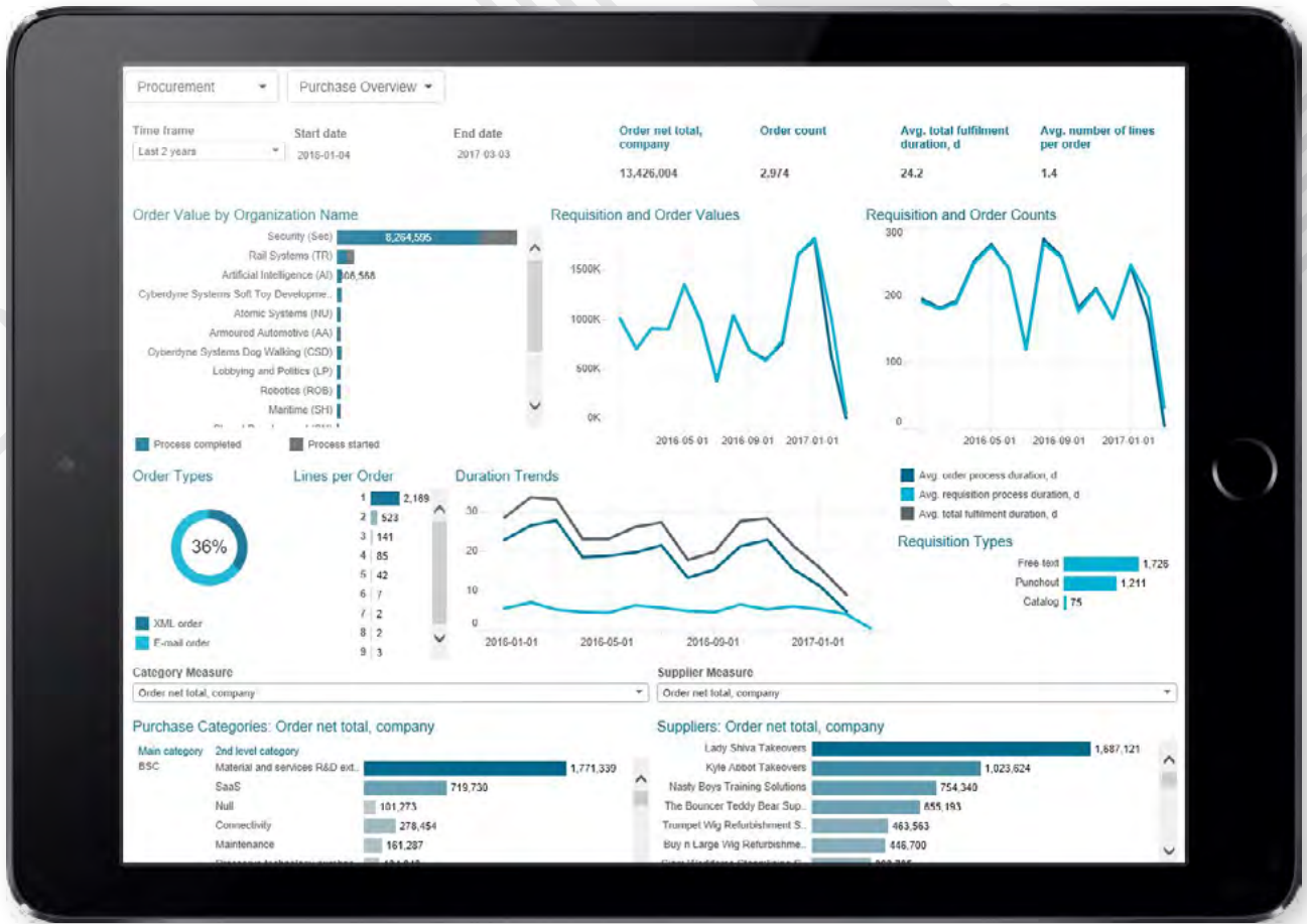
Caption for the screen shot. Lorem ipsum dolor sit amet, consectetur adipiscing elit, sed do eiusmod tempor incididunt ut labore.