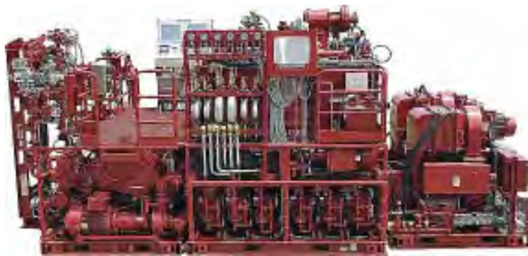
ELECTRIC VERSION: An electric system with twin GEB-22 AC motors rated at 1150 base horsepower each.

“We have introduced safety features that tell the skid