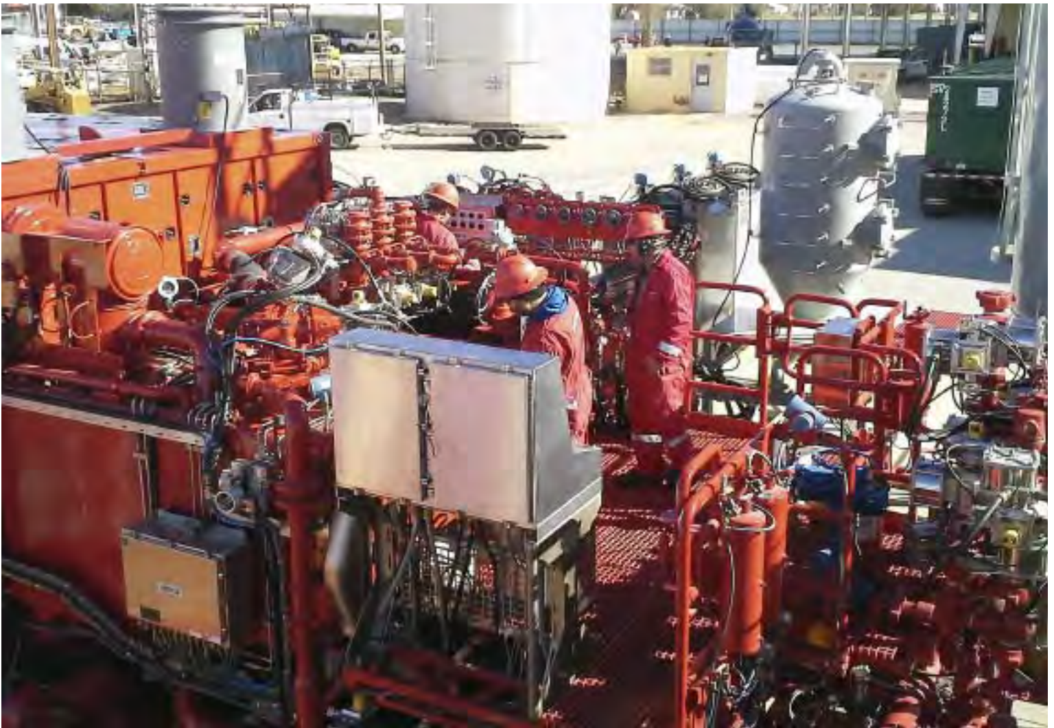
MIX RESULTS: Three engineers in Duncan, Oklahoma, perform a cement mixing test during the technology verification phase of the project.

it a step further by ensuring different systems in the completions process, such as the bulk delivery equipment and the liquid additive equipment, could communicate, and that personnel could interact with that information.