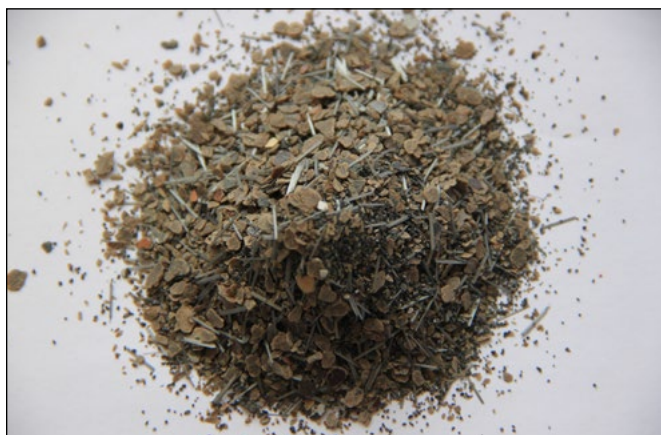
A blend of coarse and angular materials along with fibers in BridgeMaker Family of LCM spacer fluid help overcome the challenge of lost circulation.