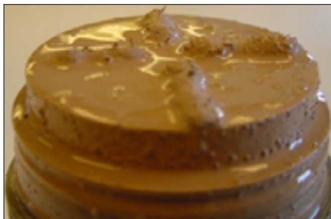
The bridging ability of the BridgeMaker™ Family of LCM spacer fluid helps ensure effective blocking of formation fractures at a wide range of fracture widths.