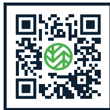
Dell - Wasabi Partner Page