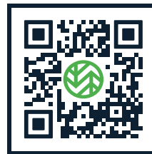
Wasabi Blog: How Dell is Embracing the Cloud with Wasabi

For more information please contact: Wasabi@Dell.com