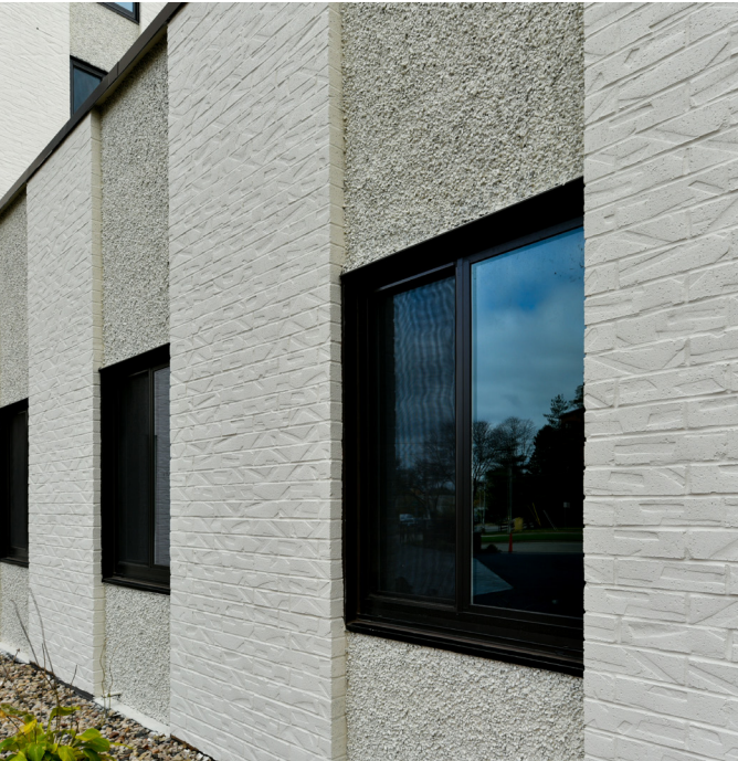
Renaissance Senior Living of Hilldale - Madison, Wisconsin