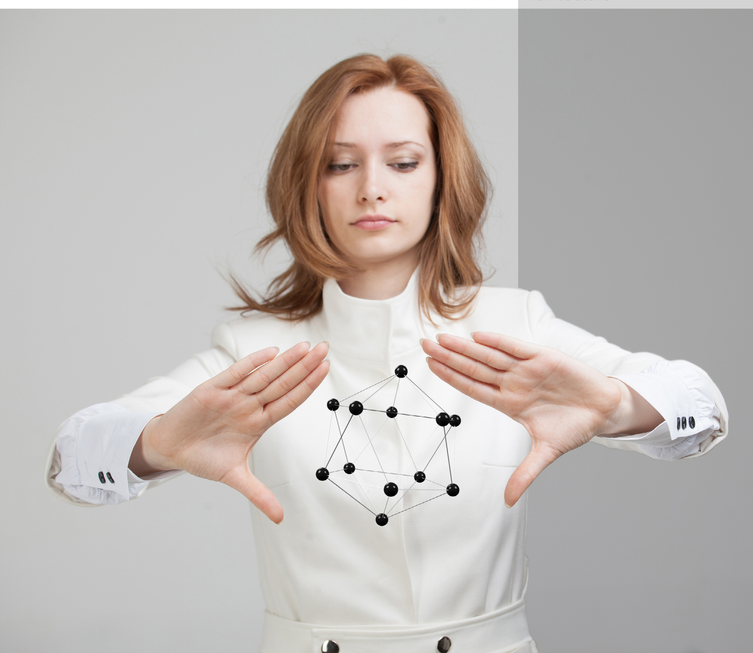
The Science of Clean Architecture