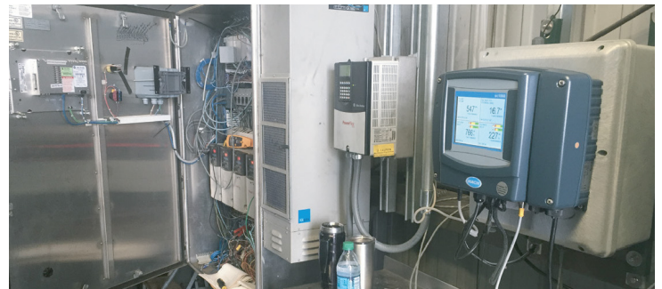
Hach Real-time Control for Sludge Thickening (RTC-ST) installed to help monitor and adjust chemical treatment, pH level and flow in a dairy facility's wastewater treatment plant.

One challenge is that the pH levels have to be within their wastewater discharge permit. This presents a challenge because the chemicals that help control TSS also reduce pH levels. Their sewer bill is tied to the flow, BOD and TSS levels of the effluent they discharge, so treating and balancing these parameters more efficiently could have a real impact on the bottom line.