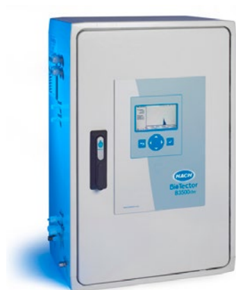
B3500dw Online TOC Analyzer

The drinking water facility worked closely with an engineering firm, which made projected estimates for how to treat the new source water, including caustic dosing, coagulation dosing, Floc/Sed basin contact time, and other estimates related to the biofiltration plant's performance.