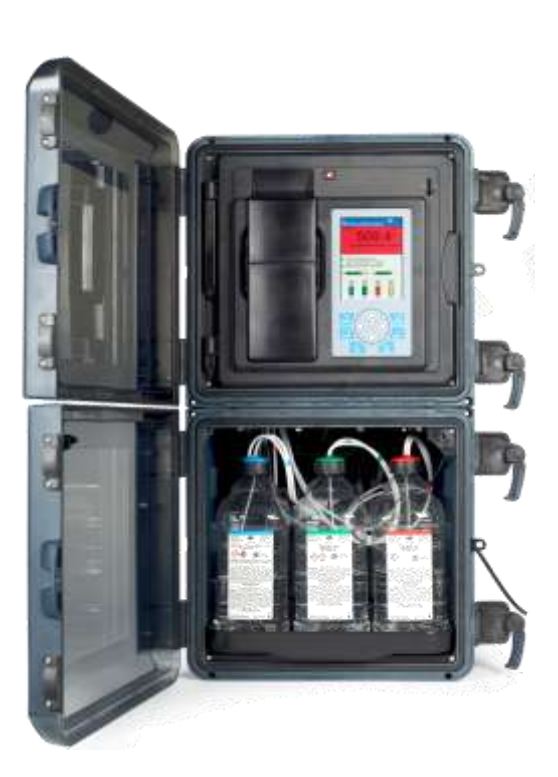
Figure 3: Hach 5500sc Silica analyzer

For more information regarding the 5500sc Silica Analyzer, please visit hach.com/silica.